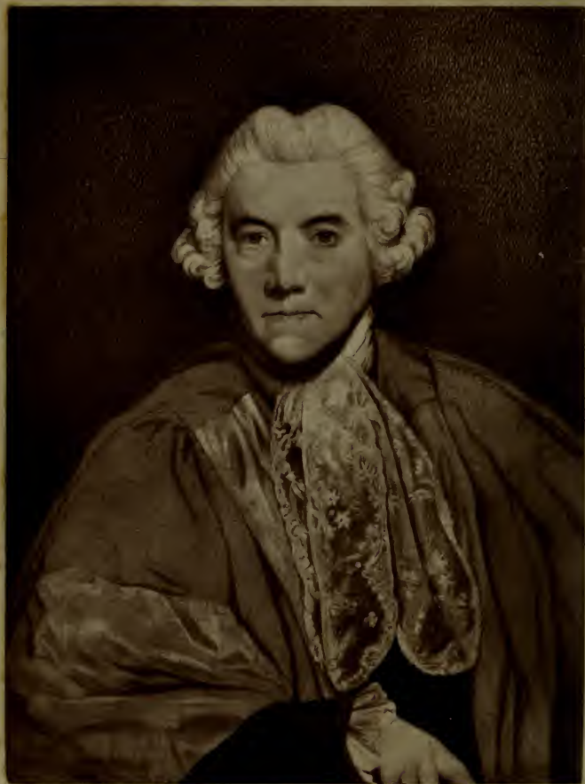
FROM A PAINTING BY SIR JOSHUA REYNOLDS.

I kiss all my dear Children, no man ever had better. John Hely Hutchinson